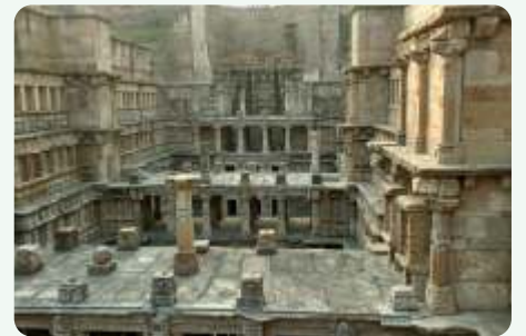
Rani ki Vav, Patan